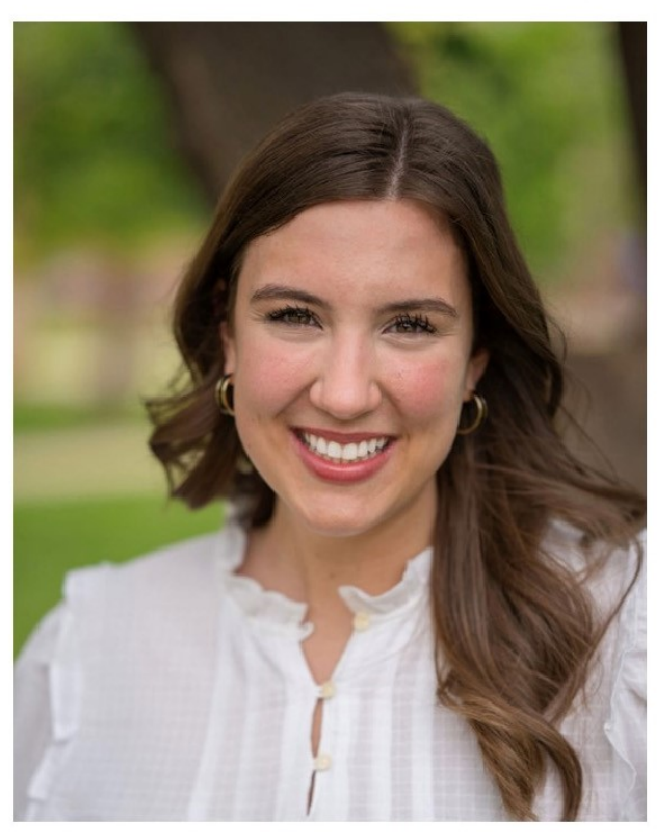
November 12, 2023 3:00 pm Central United Methodist Church 1011 Second Street Freewill Offering to benefit the AGO Young Artist Series